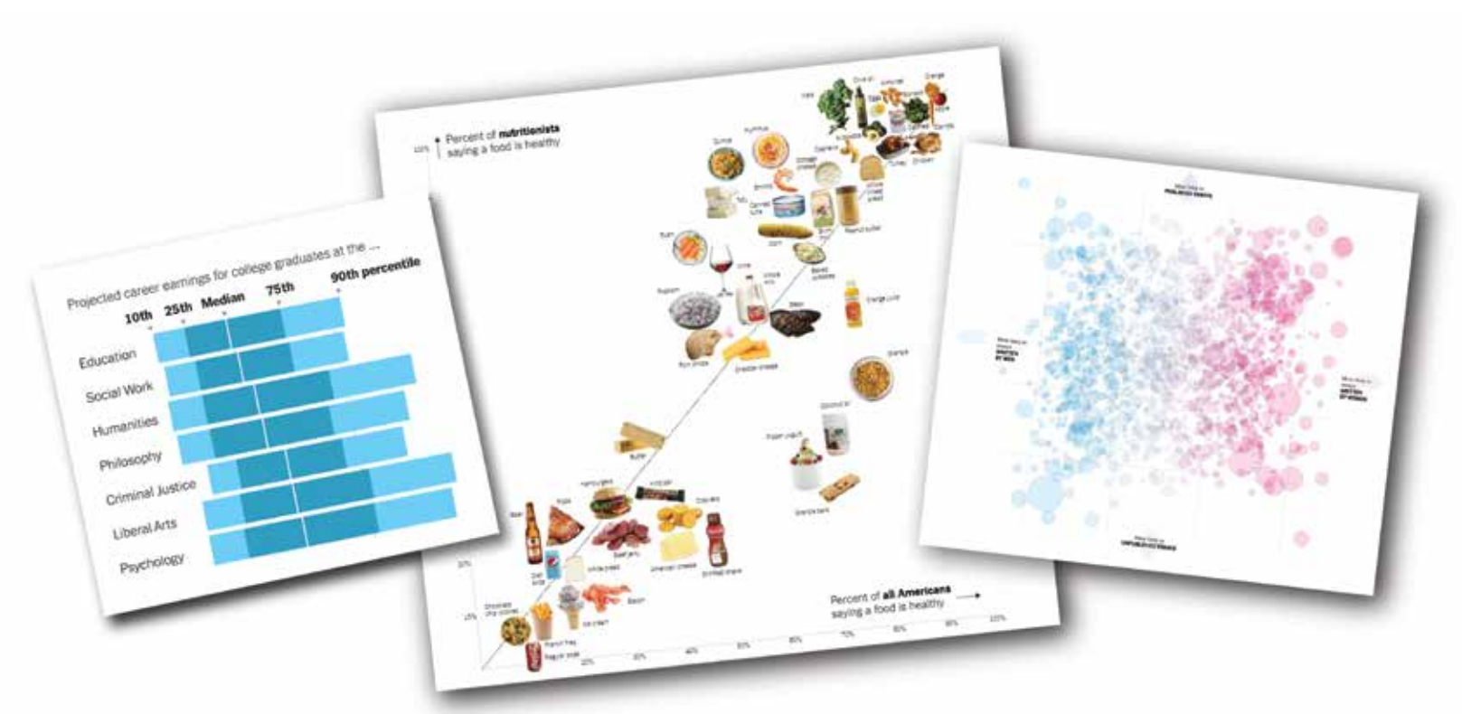
Graphs from The New York Times discussed in What's Going On in This Graph?